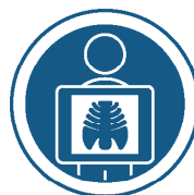
X-RAY MRI AND CT TRANSLUCENT